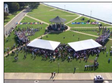
Fort Monroe Deactivation Ceremony September 15, 2011 Viewed from the Roof Top Garden